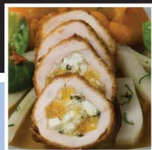
Apricot & Goat Cheese Chicken