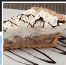
Praline Cream Pie