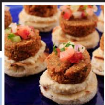
Grilled Pita Falafel and Vegetable Relish